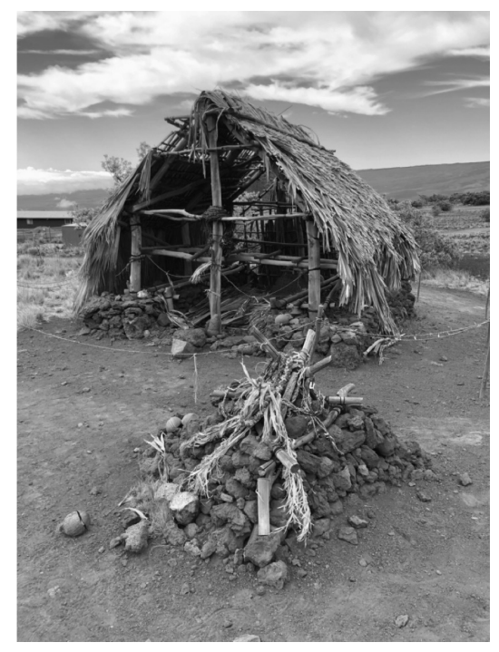
FIGURE 3. Ahu with hoʻokupu at Hale Kū Kiaʻi Mauna, which was located across the street from the Mauna Kea Visitor Center.