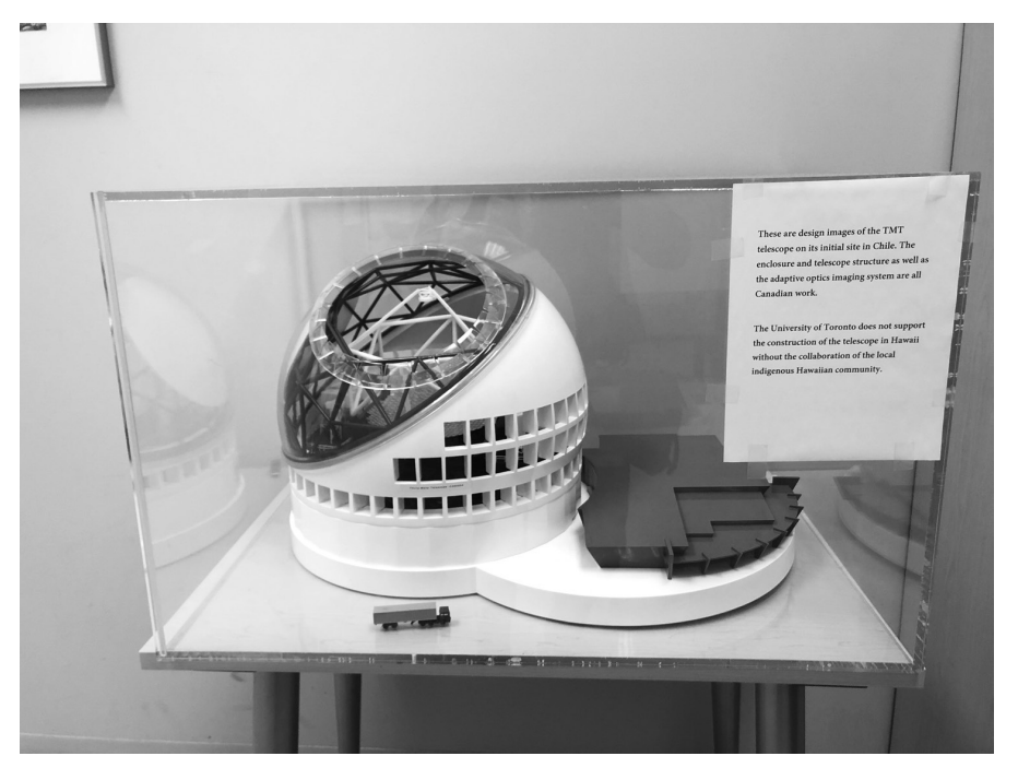
FIGURE 2. A model of the TMT in the University of Toronto's Department of Astronomy and Astrophysics, with a note: "These are design images of the TMT telescope on its initial site in Chile. The enclosure and telescope structures as well as the adaptive optics imaging system are all Canadian work. The University of Toronto does not support the construction of the telescope in Hawaii without the collaboration of the local indigenous Hawaiian community."

participation in frontline defense at Mauna Kea is a cogent method to analyze the multifaceted struggle against it. As such, the method presents a methodological criticism of scientific objectivity that disguises subjective valuations at the heart of haole technoscientific desire.<sup>25</sup> It is a decolonial methodology for Indigenous scholars writing about our own Indigenous movements for life, land, and sovereignty. This is writing about the work of getting land back to actually get land back.