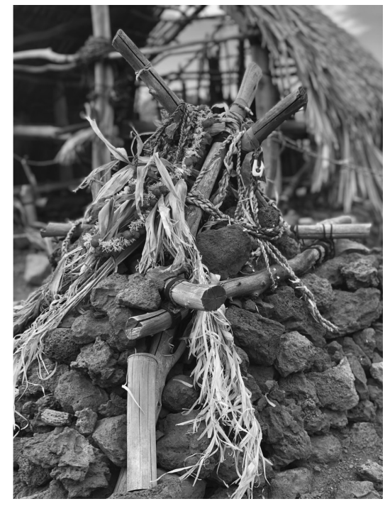
FIGURE 4. Hoʻokupu of ʻohe wai (bottom) and makau (top right) at the ahu of Hale Kū Kiaʻi Mauna, all of which was seized by the State of Hawaii in preparation for TMT construction.