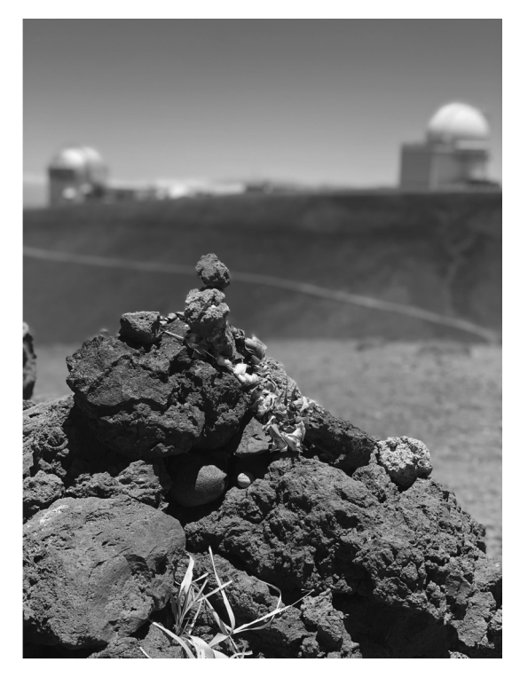
FIGURE 5. Hoʻokupu of baked clay from San Ildefonso Pueblo at Mauna Kea's summit on the ahu of Puʻu Kūkahauʻula, with the United Kingdom Infrared Telescope (left) and the University of Hawaii Telescope (right) in the distance.

where TMT's build site is located (fig. 6) were demolished. Although the state constitution claims to protect Native Hawaiian customary and traditional cultural practices, including religion, with an attempt to eliminate Kanaka Maoli relations with Mauna a Wākea by desecrating and destroying religious offerings, it instead has demonstrated it will remove hoʻokupu and ahu to assist astronomy industry development and to secure settler capital.